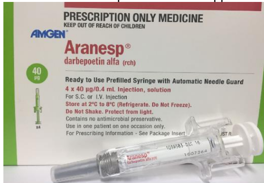
Darbepoetin can be useful in cats with anaemia due to chronic kidney disease

Recombinant human erythropoietin analogues (R-HuEPO), including epoetin and darbepoetin, have been used in CKD cats with improvements in appetite and quality of life identified. Both products are identical to the naturally occurring hormone in people and relatively similar (83.3%) to feline erythropoietin. Darbepoetin has a prolonged half-life, requiring less frequent administration than epoetin, but is more expensive.