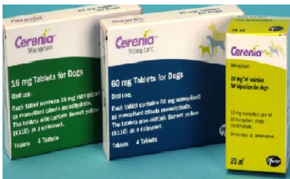
Maropitant can be a useful drug to reduce vomiting in cats with kidney disease

Maropitant inhibits NK1 receptors and is an effective, once daily antiemetic in cats with few adverse effects. Pain on injection may occur. Refrigeration reduces pain in dogs and this appears true in cats. Oral formulations are also available. Maropitant can be used chronically to effect. In cats with CKD it is safe and effective in reducing vomiting. Dose between 1-2 mg/kg PO q24hrs or 1 mg/kg subcutaneously q24 hrs. One study has evaluated the use of maropitant in cats with CKD compared with placebo. It was administered at a dose of 4mg orally, once daily for 2 weeks. Although cats receiving maropitant had less vomiting, there was no significant difference in appetite, activity scores, weight or serum creatinine compared with placebo.