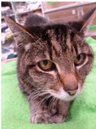
An older cat with reduced body condition score and chronic kidney disease

Malnutrition in CKD patients occurs secondary to uraemic gastroenteritis, dehydration, azotaemia, electrolyte derangements, anaemia and underlying diseases. Underweight CKD dogs have shorter survival times and malnutrition likely has similar negative effects in cats. Kidney diets improve survival, so it is important to address any causes of inappetence that contribute to diet change failure.